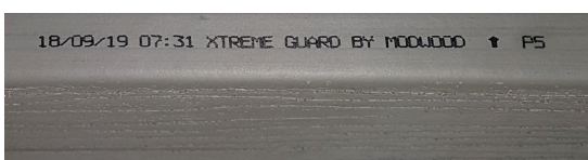
Inkjet message on square edge board