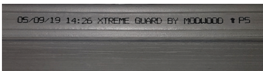
Inkjet message on grooved board

It is important that this is communicated to the installer!